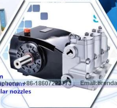
Ⓐ High pressure water pump

Standard 60m long dia 19mm high pressure hose reel. WhatsApp & Telephone: +86-18607222773 Email: brenda@cclwtruck.com