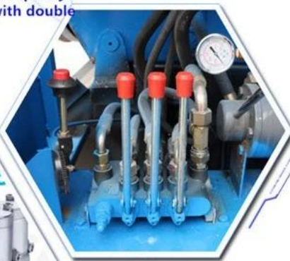
Ⓐ Multiple valve set