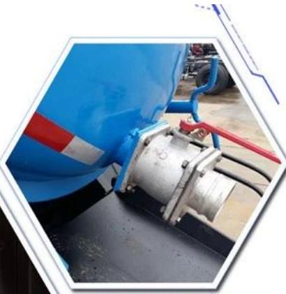
Ⓐ Rear self-flow outlet

The sewage suction tank adopts dual-cylinder dumping, and is not afraid of blockage of large dirt. It is more convenient to dump sewage.