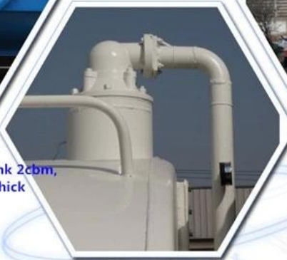
Ⓐ Anti-overflow valve

Sewage tank 8cbm and water tank 2cbm, tank material Q235 with 6mm thick