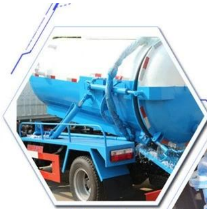
Ⓐ Sewage tank tipping

The sewage suction tank adopts dual-cylinder dumping, and is not afraid of blockage of large dirt. It is more convenient to dump sewage.