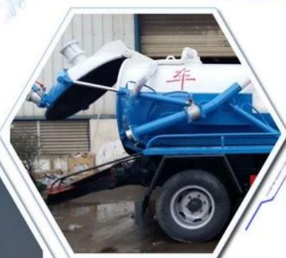
Ⓐ Rear door hydraulic open

Anti-overflow valve can prevent liquid overflow