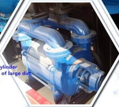
Ⓐ Sewage pump

Equipped with Chinese famous brand pump YIFENG. The sewage tank capacity more than 8cbm is equipped with double pump for better suction.