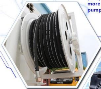
Ⓐ High pressure hose reel

Equipped with Chinese famous brand pump YIFENG. The sewage tank capacity more than 8cbm is equipped with double pump for better suction.