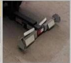
real towing device