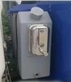
washing hand tank