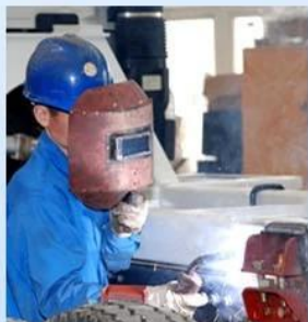
FACTORY SUPPLY DIRECTLY