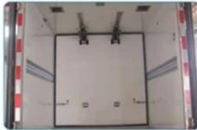
Mobile sparate hard board