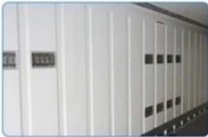
Groove ventilating shot