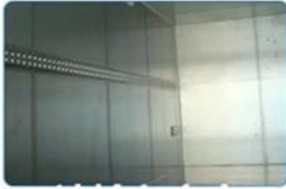
304 Stainless skin