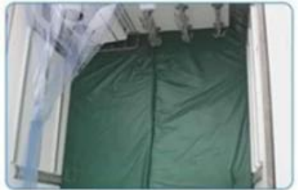
Mobile sparate soft board