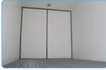
Guide rail of bottom Aluminum steel of bottom