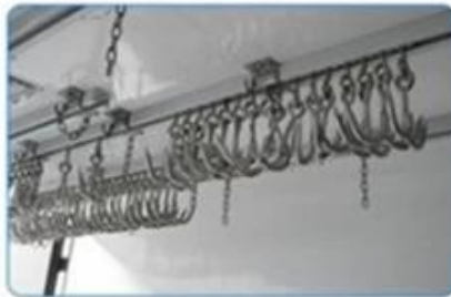
Guide rail of meat hook