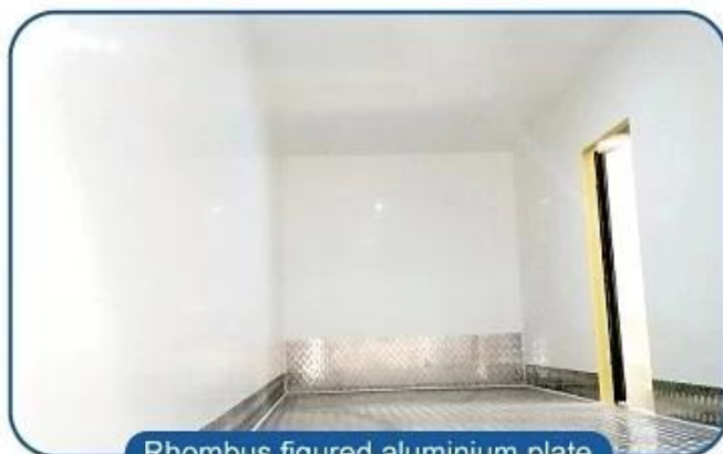
Rhombus figured aluminium plate