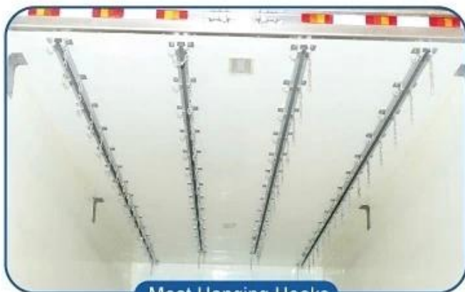
Meat Hanging Hooks